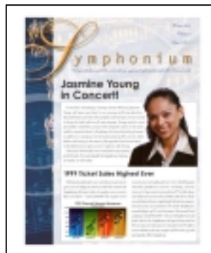
Graphic File 32% Coverage