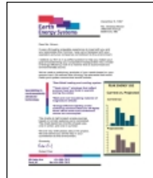
Colour Business Proposal 20% Coverage