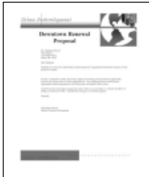
B&W Business Letter 5% Coverage