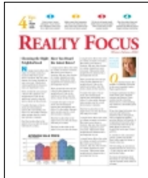
Newsletter 15% Coverage